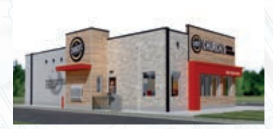
BLAZE IMAGE DRIVE - THRU RESTAURANT