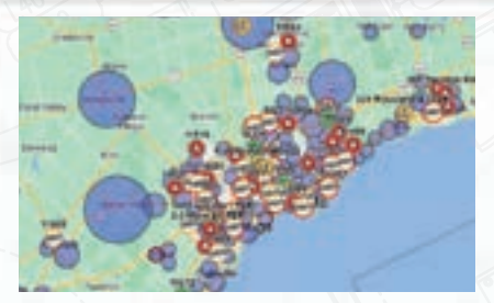
STRATEGIC MARKET MAPS